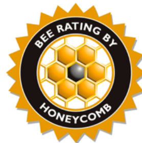
Verification Manager Honeycomb BEE Ratings